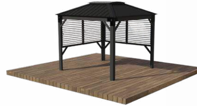
Base Model + 2x Horizontal Louver Panels