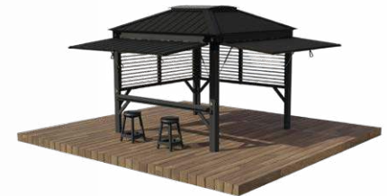
Base Model + 2x Horizontal Louver Panels + 1x Bar Kit with Stools + 2x Cabana Roof Extensions