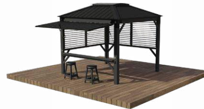
Base Model + 2x Horizontal Louver Panels + 1x Bar Kit with Stools + 1x Cabana Roof Extension